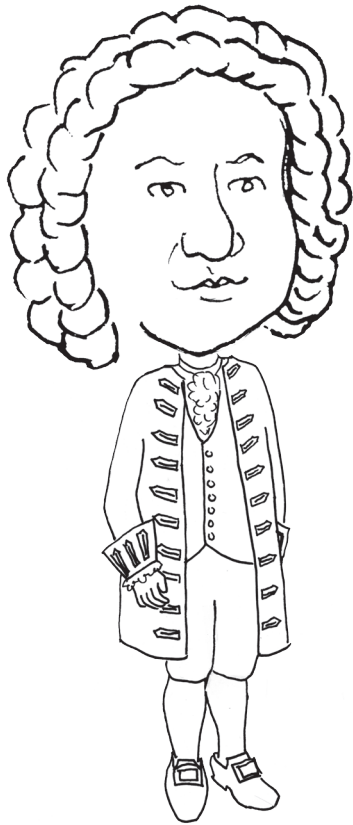
Bach March 31, 1685