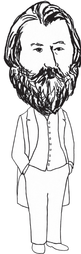
Brahms May 7, 1833