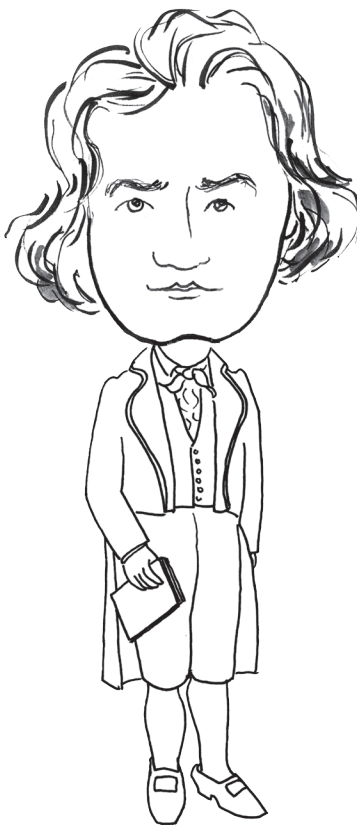
Beethoven December 16, 1770