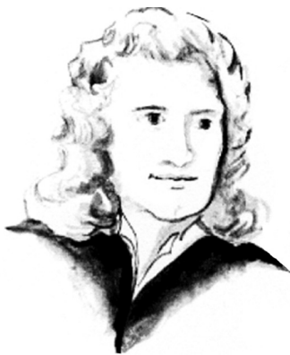
Isaac Newton Born Dec. 25, 1642

ISAAC NEWTON was an ASTRONOMER . He discovered the LAWS of MOTION and GRAVITATION . He developed a theory of COLOR by studying OPTICS with a prism. He also developed CALCULUS .