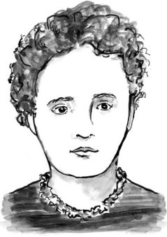
Marie Curie Born Nov. 7, 1867

Optional Activity: Chose a crossword puzzle as a topic for a paragraph about each scientist.